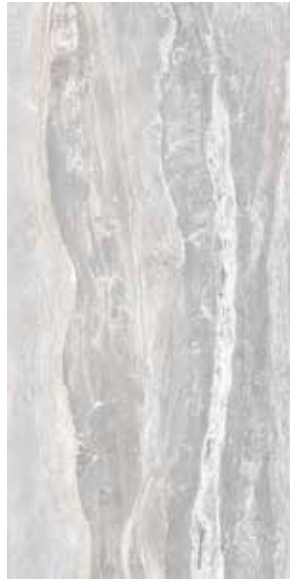
04BRESIL1224 (matte) 04BRESIL1224P (polished)