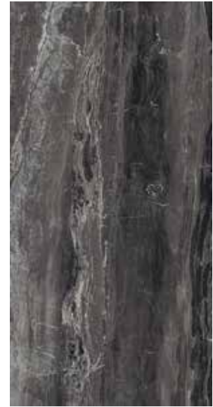
04BRENOI1224 (matte) 04BRENOI1224P (polished)