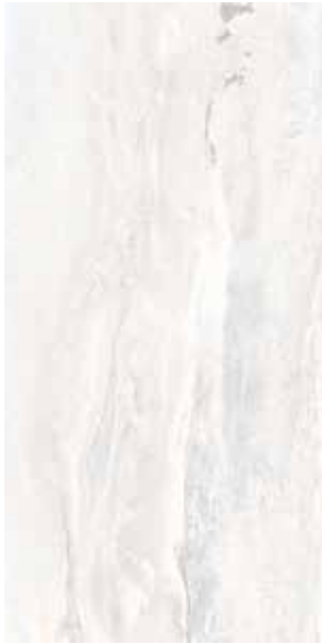
04BREWHI1224 (matte) 04BREWHI1224P (polished)