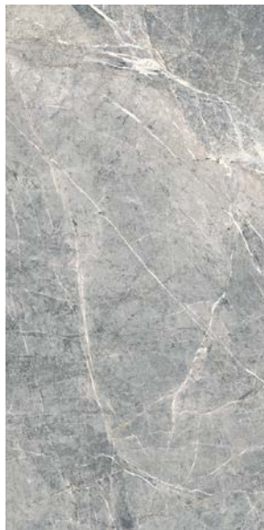
04EPIIMP1224 (matte) 04EPIIMP1224 (polished)