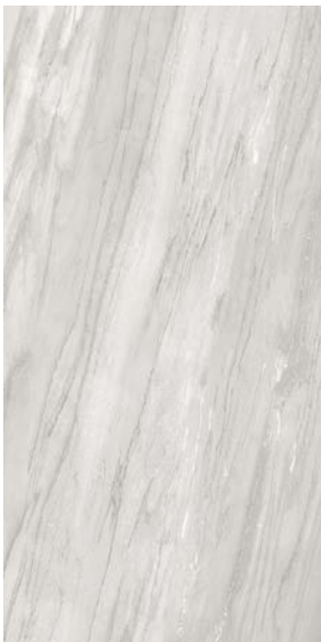
04EPIALA1224 (matte) 04EPIALA1224 (polished)