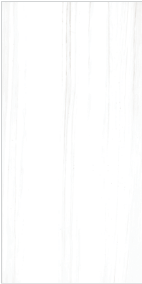
04EPIDOL1224 (matte) 04EPIDOL1224 (polished)