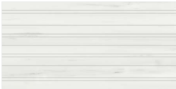
Stripes (available in all colors)