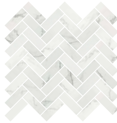
Herringbone Polished 15MARCAL13HP